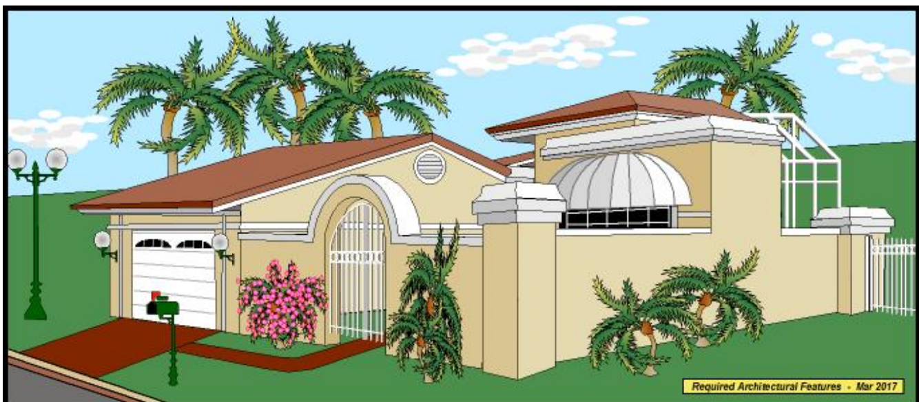
The figure above shows the required architectural features for Villa Floresta residences.

Normal home maintenance and routine repairs do not require ARC approval, provided that products employed are as specified in this document.